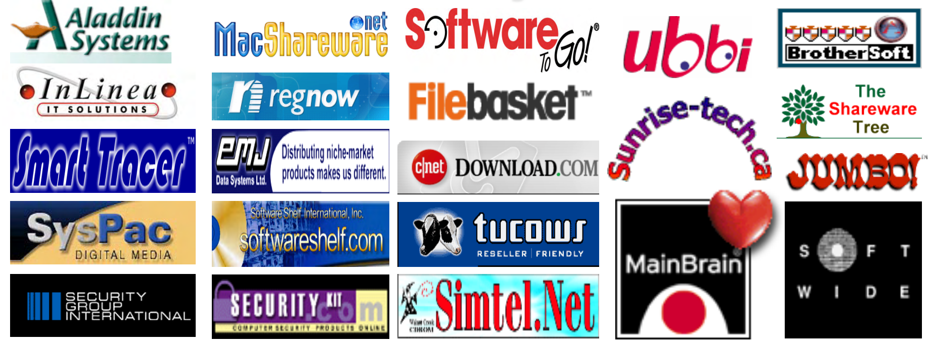
Some of our Strategic Partners

MacPhoneHome Tracks & Locates Missing Computers